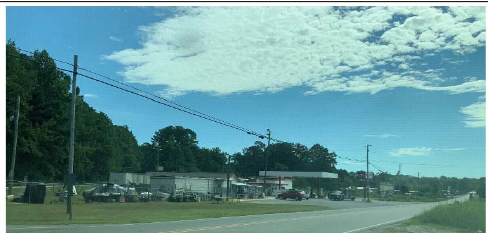
Comet Used Furniture on the left, Comet Mini-Mart on the right.

The house had a patch to the roof after-